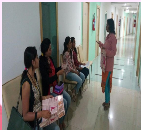
CBE Camp at Infosys