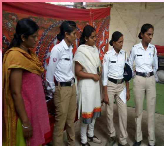
CBE Camp for Gramin Police Force