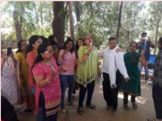
The conquerors and care givers having a gala time

PCCM's Annual Picnic for all conquerors and caregivers was organized on 5th March 2017. The staff and patients and their families went to Mapro Gardens, Mahabaleshwar. This was our third consecutive annual trip to Mapro Gardens on popular demand. The Rotary Club of Kalyani Nagar organized an orchestra of old melodies which saw the happy picnic troupe dance and sing together.