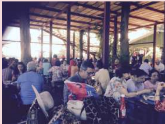
Lunch at Mapro Gardens